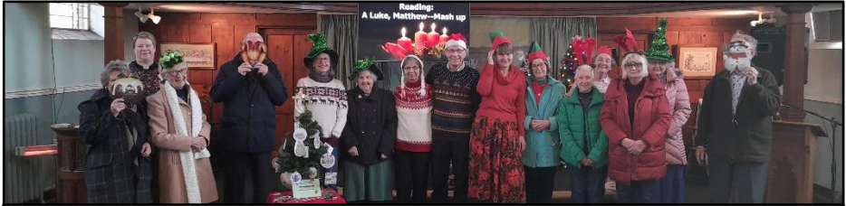
A 'Spoof' Christmas from Langford, with hats and masks showing Christmas trees, puddings, turkey, elves, Brussels sprouts and more!

It seems a long time ago now, but here are a few images from some of the Christmas services in the Eastern Section.