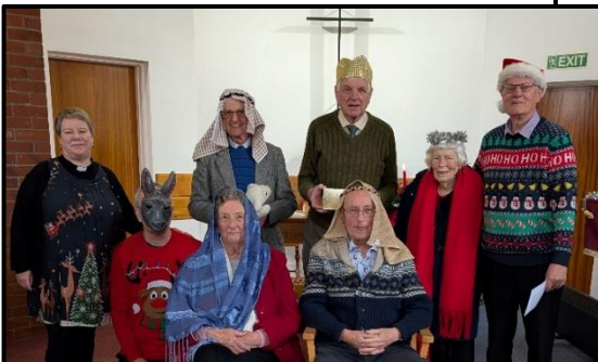
Henlow on Christmas Day – recalling childhood nativity plays and reflecting on some of the nativity characters. We had a laugh!