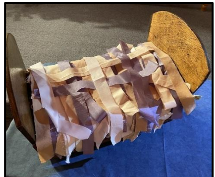
At Trinity's Carol Service, strips of cloth were laid in the manger, to symbolically make a welcoming place for the Christ-child