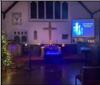
A quiet 'blue' Christmas service at Sandy